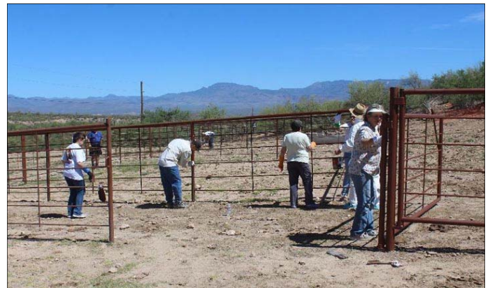
Above: They started out with four gallons of primer—not enough to complete the project. That's a lot of fencing!