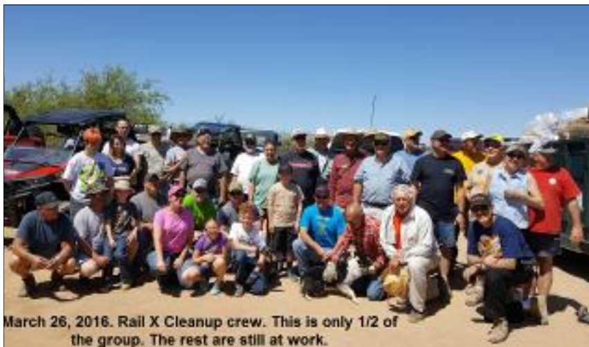
March 26, 2016. Rail X Cleanup crew. This is only 1/2 of the group. The rest are still at work.