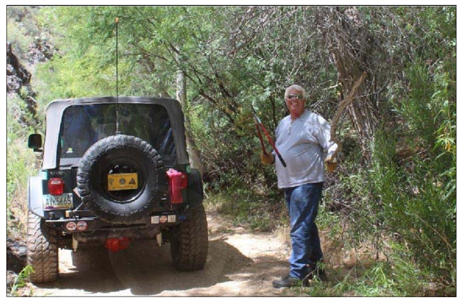
Lots of trimming; lots of work; lots of fun!