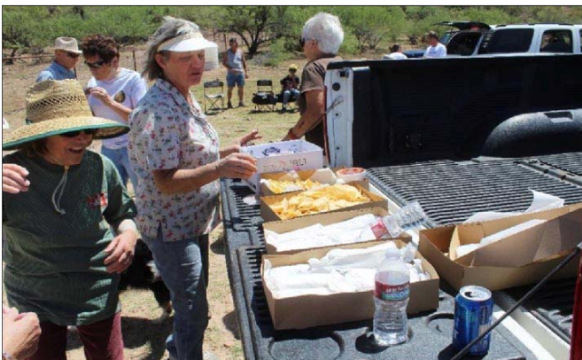
We were rewarded with good food from Guayo's Restaurant.