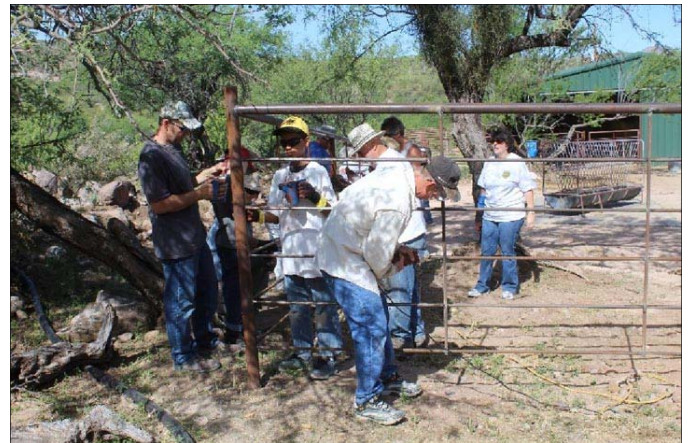
Above two photos—repairing fences and readying them for primer.